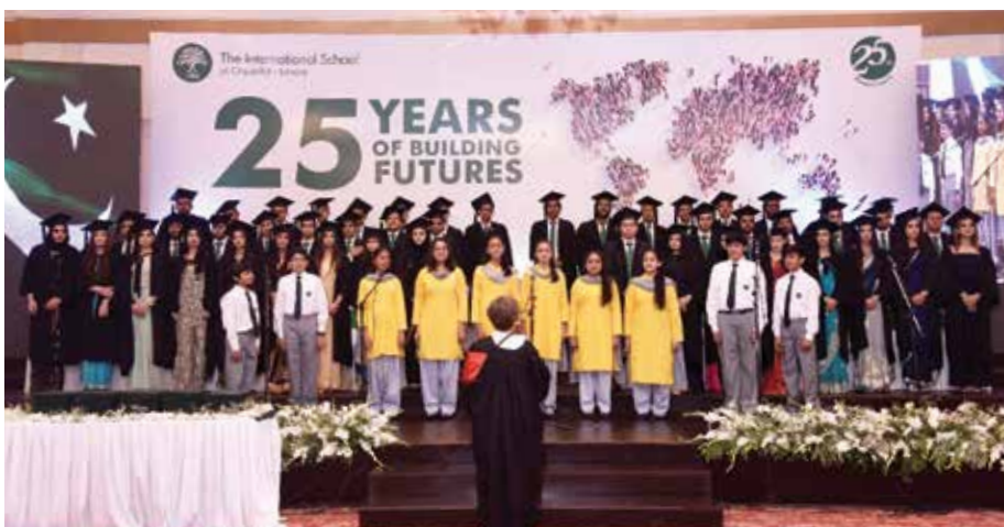
The Grade 6 and 7 Choir sang the National Anthem of the Islamic Republic of Pakistan