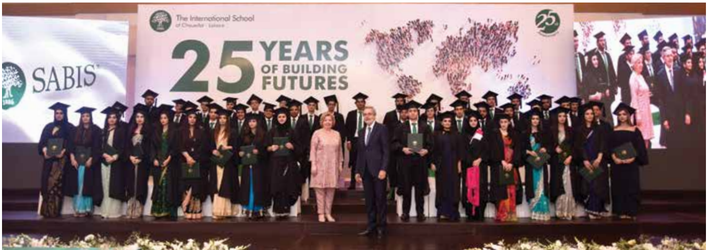
Congratulations to the Class of 2018

A graduation ceremony is always a very special occasion, signifying an important milestone in a student’s career: the successful completion of twelve years of formal education. For the Class of 2018, however, it was an extra special event as they graduated during ISC-Lahore’s 25 th anniversary. The celebrations of the past months culminated in what can only be described as a graduation extravaganza, held on June 2, 2018, at the Pearl Continental Hotel in Lahore.