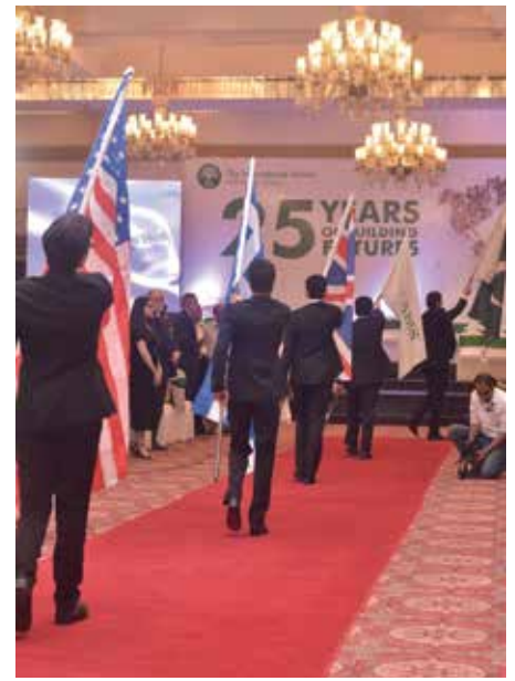
Flag Bearers head the Processional holding flags of the host nation, SABIS® and the nationalities represented amongst the graduating class