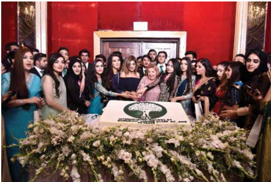
Graduates topped off the evening by cutting the graduation cake