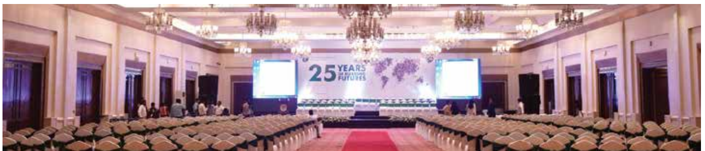
The event was hosted at the Pearl Continental Hotel, Lahore

A graduation ceremony is always a very special occasion, signifying an important milestone in a student’s career: the successful completion of twelve years of formal education. For the Class of 2018, however, it was an extra special event as they graduated during ISC-Lahore’s 25 th anniversary. The celebrations of the past months culminated in what can only be described as a graduation extravaganza, held on June 2, 2018, at the Pearl Continental Hotel in Lahore.