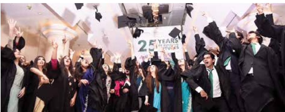
Students celebrate graduating by tossing their caps